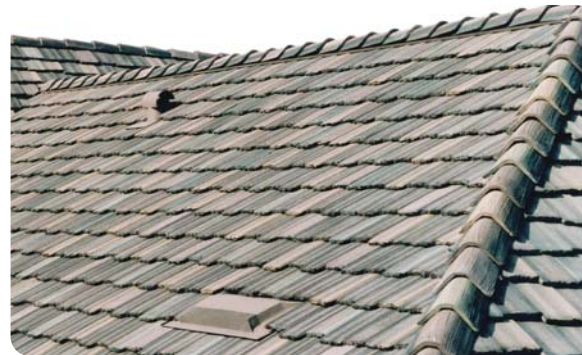
Shown with AWARD STONECOAT ™ finish.

Award Metals, headquartered in Baldwin Park, California, is one of the West's largest manufacturers of sheet metal products for the construction industry. Established in 1962, it manufactures and distributes a wide array of products for the roofing, concrete forming, drywall and stucco markets.